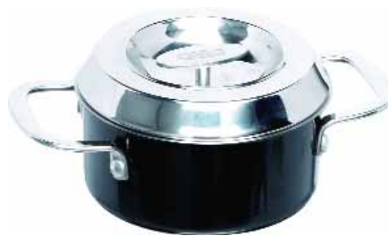
Aga Coloured Stainless Steel

Exclusive Aga coloured stainless steel with silicone exterior in cream or black. Available in casserole and saucepans.