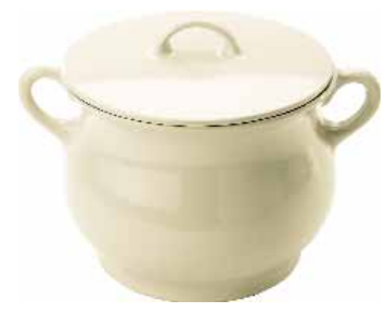
Cast Iron Danish Pot

A comprehensive range of cast iron casseroles, frying pans, skillets and baking dishes produced in our own traditional foundry.