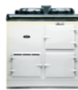
The new 3-oven Aga offers greater cooking flexibility

Terms and conditions apply. Please contact your local Aga Specialist on 08457 125 207 for further information.