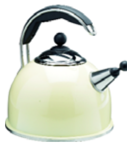
Stainless Steel Whistling Kettle

This stylish kettle has a 4mm encapsulated base for excellent heat transfer. Perfect for every Aga owner. Also available in polished finish.