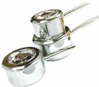
Aga Stainless Steel

The latest from the Cook Shop Collection.